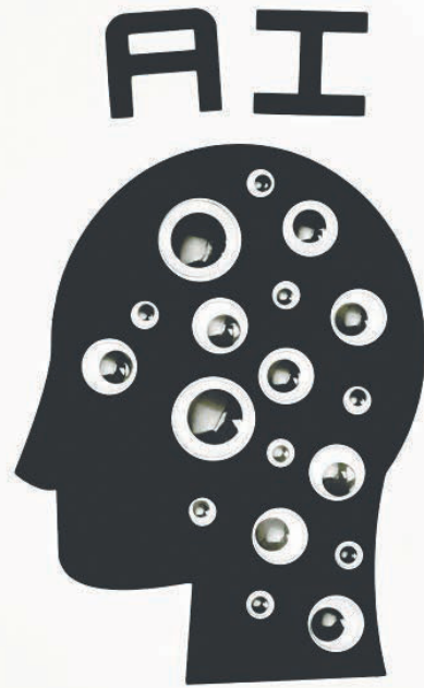
The latest model of DeepSeek is available as open source.

While intelligent conversational agents are popping up everywhere, such as ChatGPT, Gemini, Claude and Mistral to name only the most famous, DeepSeek presents itself as an original alternative, which can be tested now. - ETX Studio