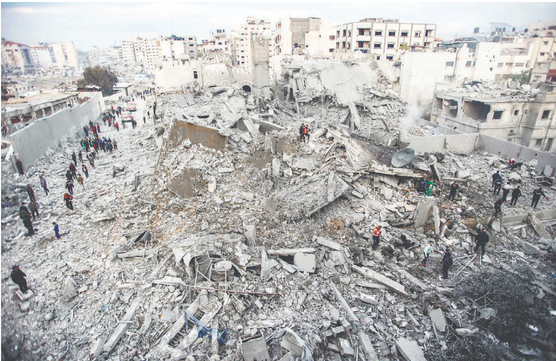
Residents and first responders inspect the rubble of a collapsed residential building that was bombed in al-Rimal in central Gaza City on Saturday.

GAZA: Israeli military strikes in the Gaza Strip have killed at least 70 people on Friday, Palestinian medics said on Saturday, as mediators launched a new ceasefire push to end the 15-month war.