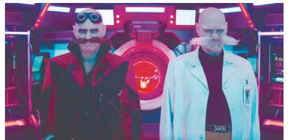
Carrey delivers an amazing performance, holding dual characters as Dr Robotnik and his grandfather Professor Robotnik.