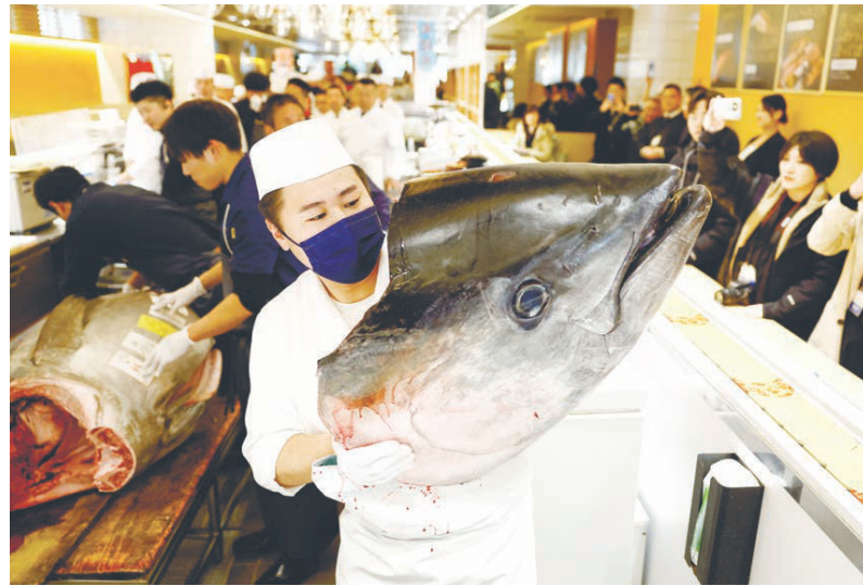
PRIZED BOUNTY... The head of a 276kg bluefin tuna was auctioned for ¥207 million (RM5.85 million) in Tokyo yesterday. It was bought jointly by sushi restaurant operator Onodera Group and wholesaler Yamayuk.

A Finance Ministry spokesperson declined to comment. — Reuters