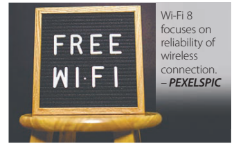
Wi-Fi 8 focuses on reliability of wireless connection.

Meanwhile Wi-Fi 7 is a technology full of promise that is only now starting to be deployed on a widespread basis. The first