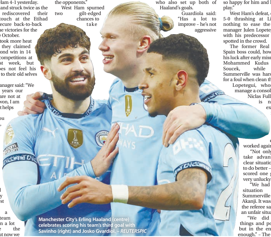
Manchester City's Erling Haaland (centre) celebrates scoring his team's third goal with Savinho (right) and Josko Gvardiol.

"We did very good things and positive things, but in the end it was not enough." – The Independent