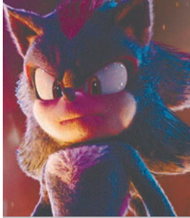
Reeves's Shadow steals the show with a performance that balances menace and vulnerability.

Reeves brings depth to Shadow, making him more than just a villain. His performance adds layers to the character, hinting at a tragic past and motivations that go beyond simple evil. Fans of the games will appreciate how faithful his portrayal is while