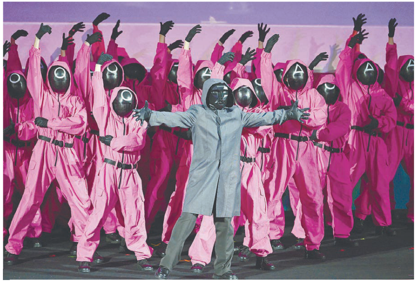
Squid Game 2 is available to stream on Netflix since last month.

▶ Labour strike in South Korea that caused casualties is heartbeat of film