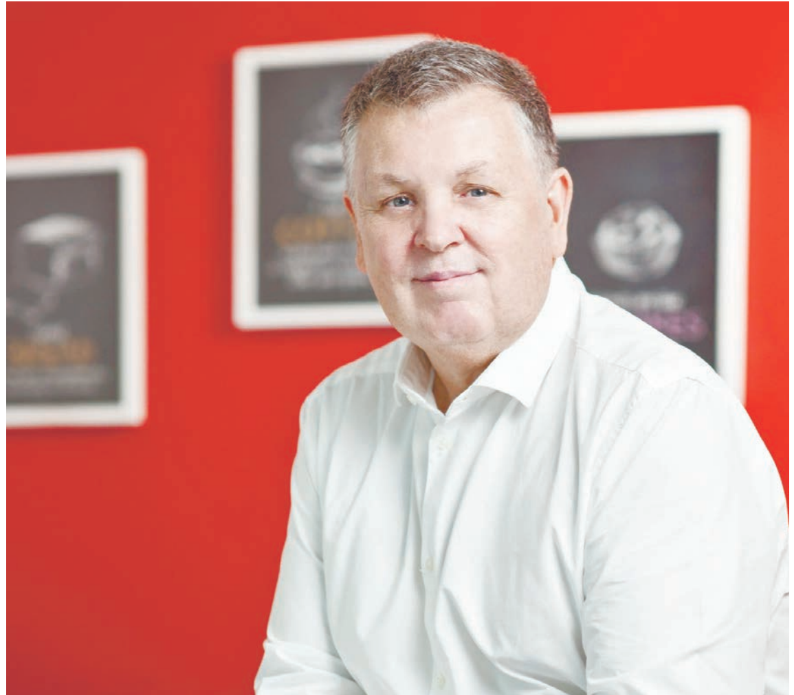
Malaysia's strategic location, strong courier networks, and growing digital consumer base provide a solid foundation for e-commerce success, says Black.

For those who feel the system is hindering progress, the accumulation of costs borne by