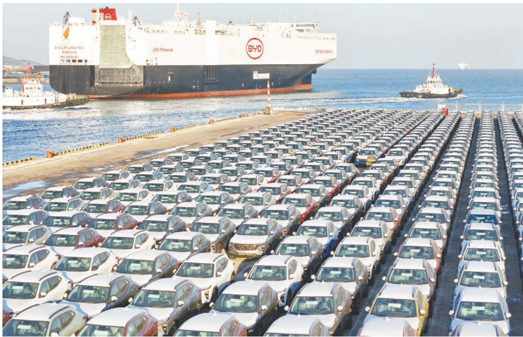
EVs waiting to be loaded on the BYD Explorer NO.1, a domestically manufactured vessel intended to export Chinese automobiles, at Yantai port. - AFP/IC

"It could be possible if resale volume rebounds in the first and second quarters, or more flats are selling for more than S$1 million." - Reuters