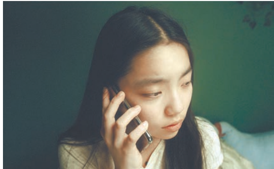
Chia's films explore sensitive themes with a delicate balance of intimacy and universality.

Through the lens of the protagonist Lianne, the film captures the uncertainties surrounding mortality and the struggles of