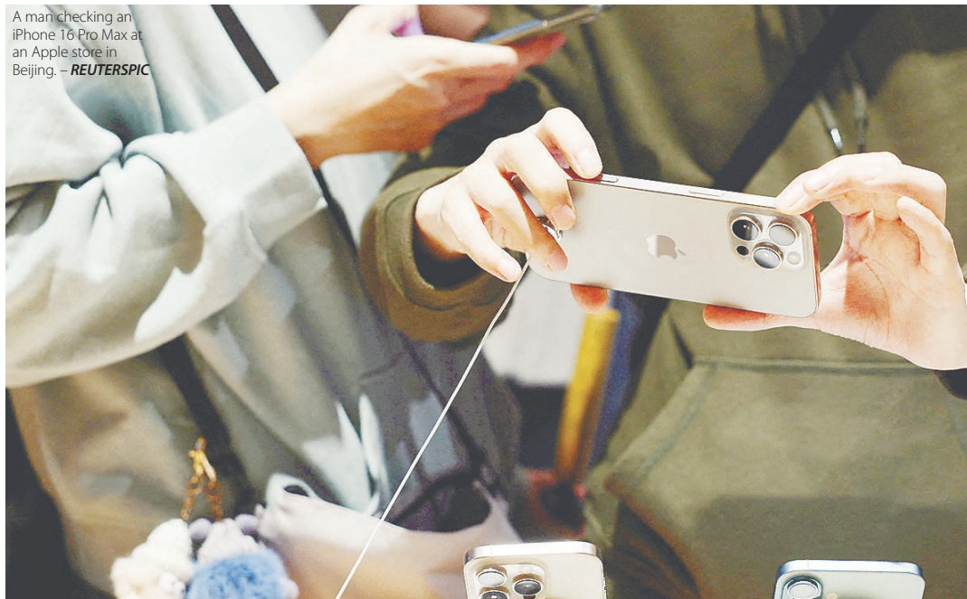
A man checking an iPhone 16 Pro Max at an Apple store in Beijing. - REUTERS/SPIC

DJI, the world's largest drone manufacturer that sells more than half of all US commercial drones, said if no agency completes the study it would prevent the company from launching new products in America. - Reuters