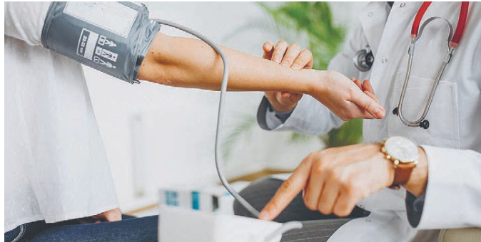
Affected policyholders are strongly urged not to terminate their policies.

Policyholders and participants are advised to check with their insurer or takaful operator on details of their MHIT plan. The two interim measures above are not applicable to premium increases that may apply when a policyholder moves to a higher age band. This will be managed by the insurer or takaful operator.