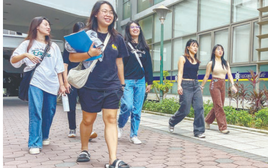
A recent report highlights concerns from industry stakeholders about the skills gaps in jobseekers, citing the lack of relevance in tertiary education programmes.

Completing a diploma or degree was once seen as a measure of one's resilience. However, with the rising cost of living, there are now numerous alternative pathways to gaining the skills needed for securing a job and earning an income - without spending