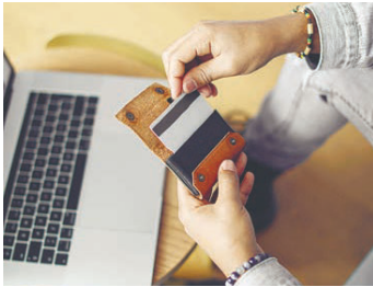
The research warns the intention economy will treat human motivations as the new currency.