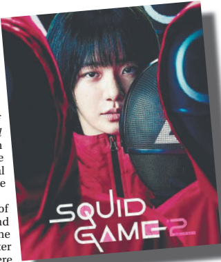
The dystopian realities of Squid Game mirrors the real world.

“I wanted to show (an) ordinary middle-class person can fall to the bottom of the economic ladder overnight,” he said, referencing the realities of the current