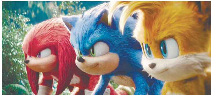
(From left) The bond between Knuckles (Elba), Sonic (Schwartz) and Tails (O'Shaughnessey) remains the emotional core of the film.