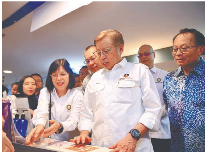
Abang Johari being briefed during his visit to the Sarawak Service Centre at the Kuching Urban Transformation Centre yesterday.

He also revealed that based on the Rahmah Cash Aid recipient list, 886,288 individuals are eligible for the Sarawak Basic Needs Assistance, with a total allocation of RM464.5 million.