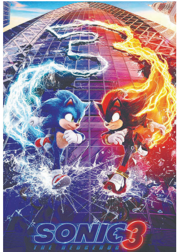
Come for the action, stay for the laughs and leave with a renewed love for the popular characters.

Some jokes feel a bit forced, especially during the film's slower moments but for the most part, the humour lands, keeping the tone light and fun.