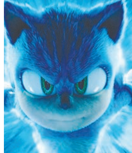
Sonic the Hedgehog 3 balances its action and drama with plenty of humour.

newcomers will find themselves drawn to the complexity he brings to the role.