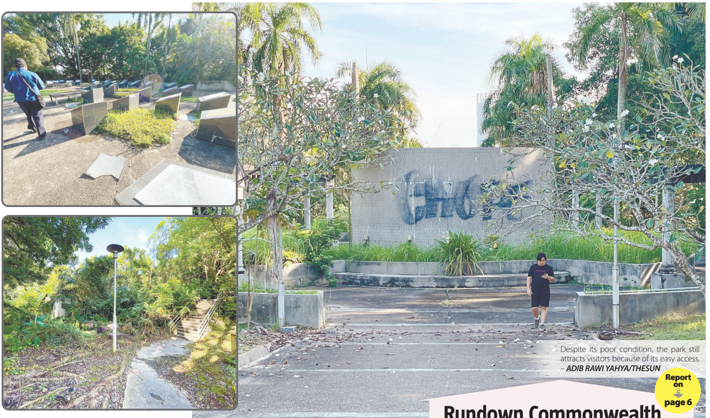
Despite its poor condition, the park still attracts visitors because of its easy access.