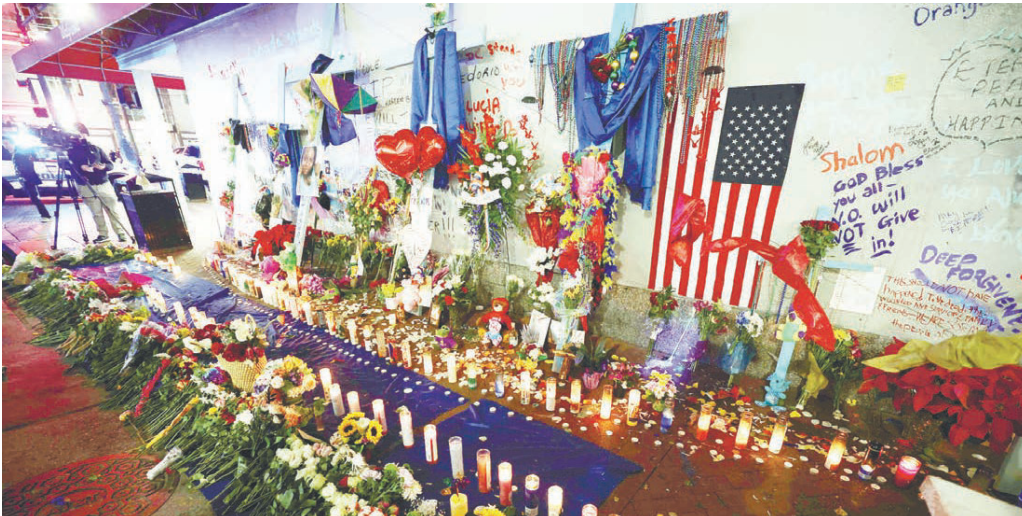
OUTPOURING OF GRIEF ... A vigil was held on Saturday for people killed on Bourbon street in New Orleans, where at least 14 revellers died when a man drove a truck into a crowd early on New Year's Day. – AFP/IC

Similar schemes are in use in other megacities including London and Stockholm, but US cities will be watching to see what impact the New York scheme has on traffic and revenues. – AFP