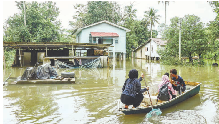
For the villagers of Kampung Bendang Perol, floods have become a way of life.

Houses in Kampung Bendang Perol frequently bear the brunt of river overflows, with water levels often