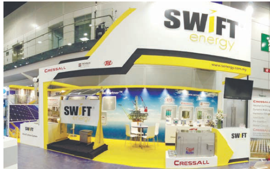
Swift Energy's booth at Oil & Gas Asia 2019. The company remains optimistic about the future, supported by several key industry trends.

Swift Energy's main manufacturing segment demonstrated substantial growth, increasing by 22.79%, from RM71.45 million in FY23 to RM87.74