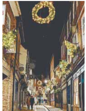
The Shambles during Christmas. – BESTTHINGSTODOINYORKPIC

tourist crowds while still enjoying full Christmas activities that would have already started.