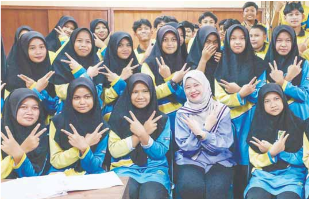
VIP VISITOR ... Education Minister Fadhliana Sidek taking a picture with students during a visit to SMK Kuala Jengal in Dungun, Terengganu yesterday.

"Payments can be as low as RM30 per month for those opting for restructuring. However, loan write-offs are not an option as they would limit opportunities for other entrepreneurs to expand their businesses." - Bernama