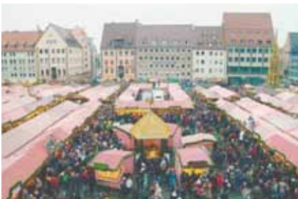
Nuremberg Christkindlesmarkt attracts plenty of visitors.