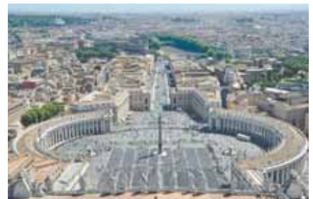
Advance booking is advised if one wishes to attend Christmas mass at St Peter's Square.