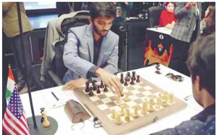
Gukesh, at 18, is the youngest ever chess world champion.

First, he reset the chess board and paid respect to it; next, he gave thanks to the Almighty; then he hugged his parents and trainer; and lastly, he praised Ding Liren as a great opponent and a true champion.