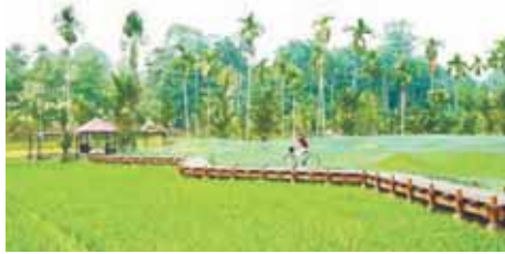
Jog through lush greenery at the Shah Alam National Botanical Park.