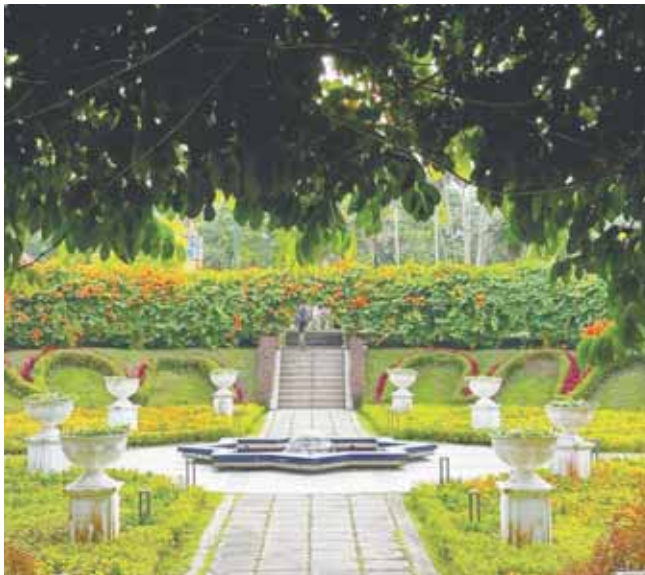
Perdana Botanical Gardens is a serene oasis in the heart of Kuala Lumpur, ideal for peaceful morning jogs.

Nestled in the heart of the city, Perdana Botanical Gardens (formerly Lake Gardens) is a serene escape from the bustling urban environment. The lush greenery, scenic lake views and well-paved paths make it ideal for joggers of all levels. Early morning runs offer a peaceful atmosphere, complemented by the chirping of birds and the occasional sight of monitor lizards. With a distance of 4km around the main areas, it is ideal for a quick and rejuvenating jog.