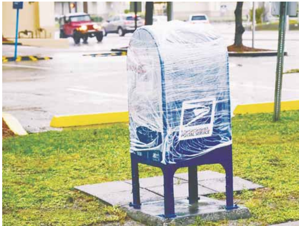
A US Postal Service mailbox is dry wrapped during hurricane season in Sarasota, Florida. — REUTERS/SPIC

The investment is worth around US$42.43 billion, based on bitcoin's previous close, according to Reuters calculations. — Reuters