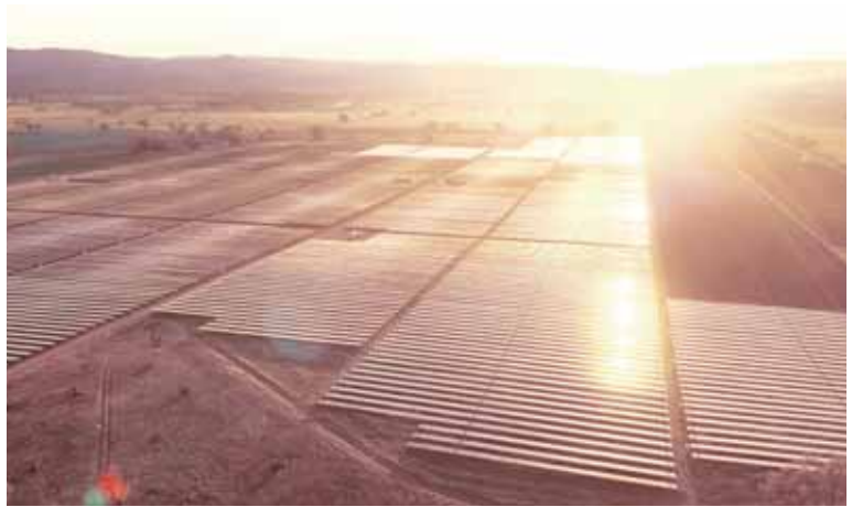
The Goulburn River Solar Farm will provide huge benefits in terms of renewable energy supply and economic outcomes for New South Wales.

Gamuda has been making strong strides in Australia's renewable energy market. In September 2024, the group was awarded the A$243 million Boulder Creek Wind Farm project in Queensland under DT Infrastructure. While its Gamuda Engineering Australia arm, in a joint venture with Ferrovial Construction signed an Early Contractor Involvement agreement in November 2024 with Alinta Energy for the multi-billion-dollar Oven Mountain Pumped Hydro Storage project in NSW.