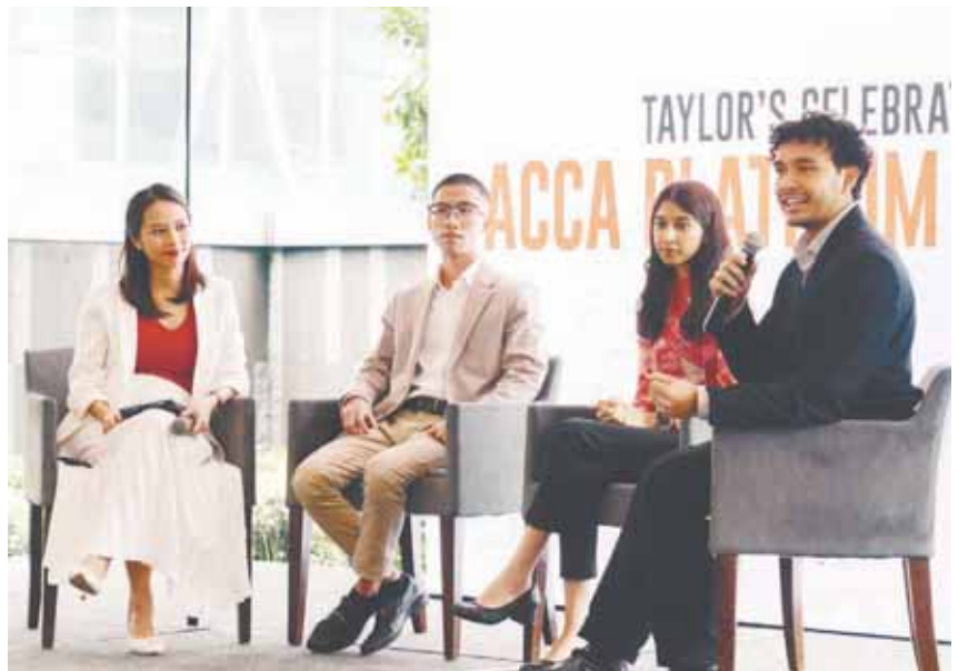
Outstanding alumnus and scholars of Taylor's College ACCA programme sharing insights about their journey to success.

In 2023, Taylor's College saw the highest score in Malaysia and second worldwide in 'Recording in Financial Transactions'. In 2024, the