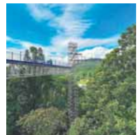
FRIM in Kepong is a beautiful place with nature trails, a canopy walk and lots of plants and trees.