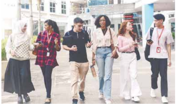
Working adults can now pursue tertiary level education with APEL at MSU

Normally, an individual with SPM qualifications applying for entry to university would qualify only for diploma studies. However, with APEL C, it now becomes possible to pursue a bachelor's degree directly.