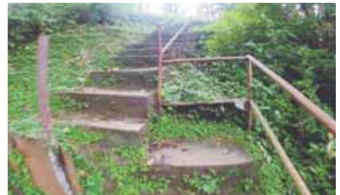
Penang Hill Heritage Trail combines fitness and history on this challenging path.

For those looking for a more challenging trail, Bukit Kiara Park offers forest paths with gentle inclines and declines. Located near Taman Tun Dr Ismail, the park provides a mix of paved and dirt trails that stretch for over 10km. It is popular among nature enthusiasts for its refreshing greenery and cool shade. The uphill sections reward joggers with breathtaking panoramic views, making the effort worthwhile.