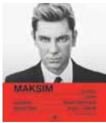
The concert will feature timeless classical pieces.

Ticket prices range from RM188 to RM888.