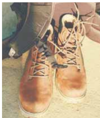
Comfort and durability is key in choosing the correct footwear for hiking.