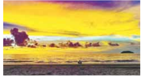
Run along golden sands with spectacular coastal views at sunrise or sunset at Tanjung Aru Beach.