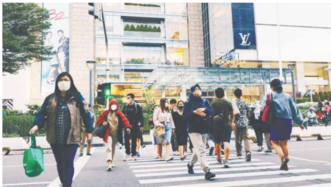
People crossing a road outside a shopping mall in Jakarta.

President Prabowo Subianto has said he wants to boost tax revenue to 18% of gross domestic product from around 10% currently, adding about US$100 billion (RM445 billion) in additional tax revenue. – Reuters