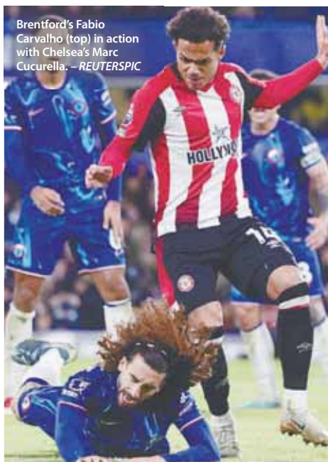
Brentford's Fabio Carvalho (top) in action with Chelsea's Marc Cucurella.