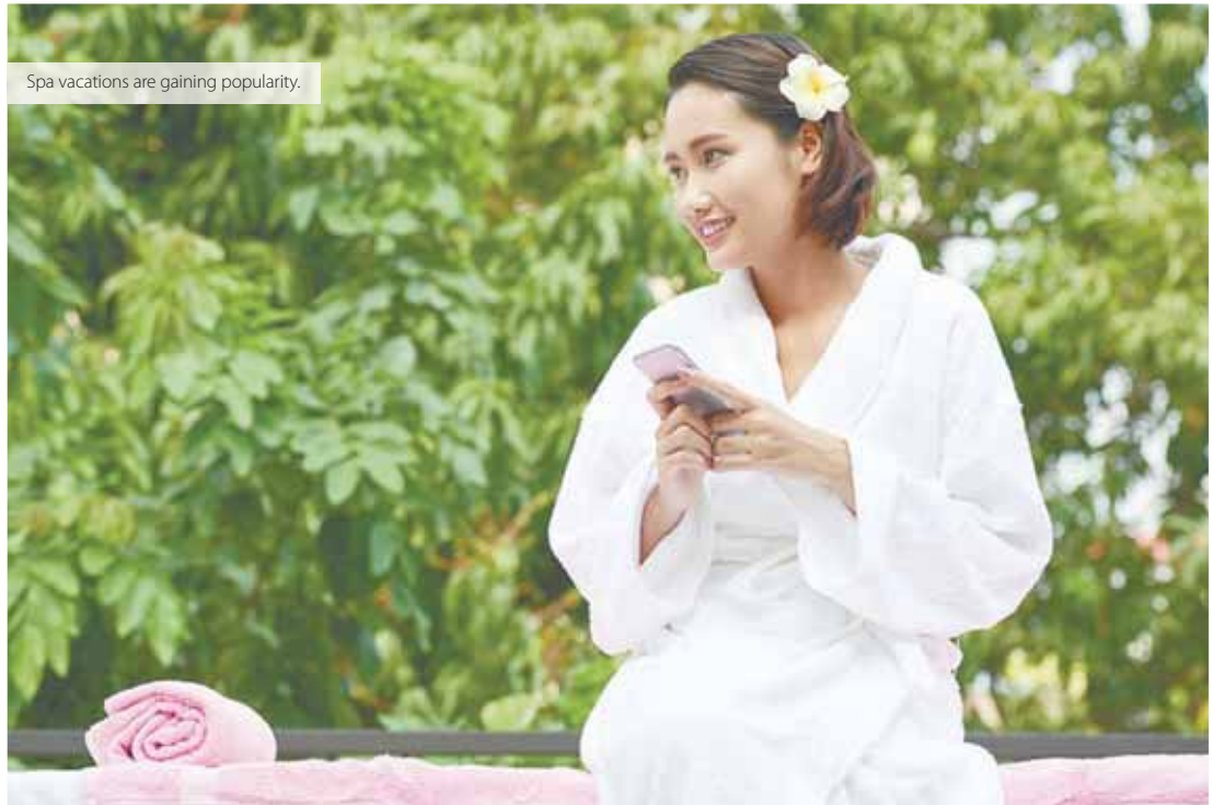
Spa vacations are gaining popularity.

On the managerial front, clear job progression and cross-dimensional, network-based models are essential, along with continuous training programmes.