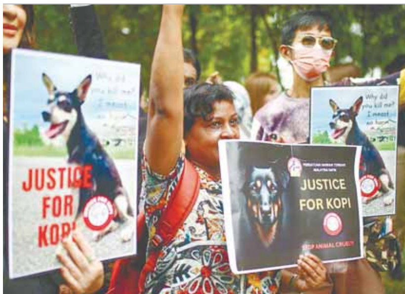
Supporters demanding justice for Kopi at the Kuala Lumpur Court Complex yesterday.

All six suspects have been remanded until Dec 20 for further investigations under Section 39B of the Dangerous Drugs Act 1952. — Bernama