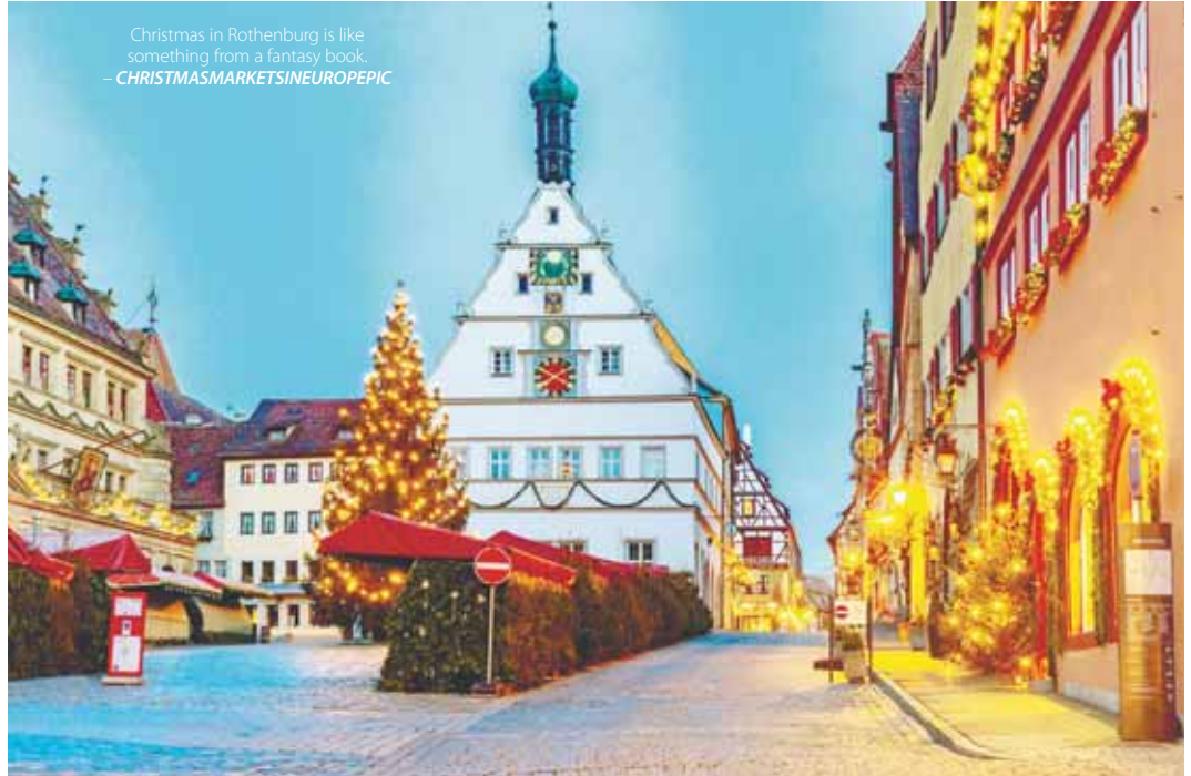
Christmas in Rothenburg is like something from a fantasy book.

The famous Nuremberg Lebkuchen (gingerbread), protected as "geographical indication" by European law, has been baked in the city since 1395 by the Lebkuchen-Schmidt family bakery. Visitors can tour the Mediaeval Dungeons and the Craftsmen's Courtyard to understand how Christmas goods were traditionally produced during the Middle Ages.