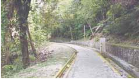
A forested retreat with scenic inclines for an invigorating workout awaits at Bukit Kiara Park.