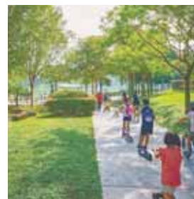
Jog in a vibrant community park with picturesque lake view at Desa Park City.

Kepong Metropolitan Park is a favourite for city joggers who enjoy a mix of open skies and green spaces. The park's 3.5km jogging trail loops around a sprawling lake, offering scenic views and a refreshing breeze throughout the route. The flat and well-maintained path makes it accessible for beginners and families