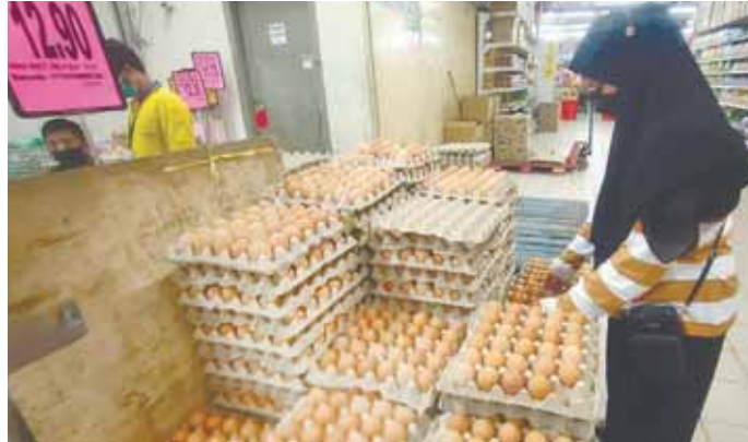
Fahmi said unlike fish, which are dependent on natural conditions, poultry farming offers a more predictable protein source.

Fahmi said unlike fish, which are dependent on natural conditions,