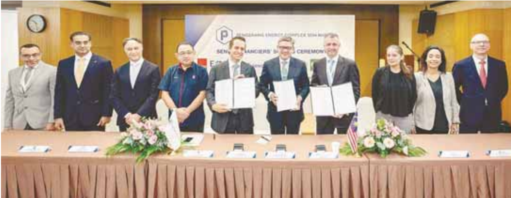
Representatives from five export credit agencies and Islamic Development Bank after ratifying the terms of financing agreements with PEC in Kuala Lumpur.