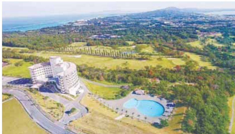
An aerial view of ANSA Okinawa Resort, which will be rebranded as ANA Crowne Plaza Resort Okinawa Uruma Hills.

Located on the main island of Okinawa, ANA Crowne Plaza Resort Okinawa Uruma Hills will offer guests panoramic views of the East China Sea and Pacific Ocean, as well as easy access to a nearby golf course and cultural sites, including Zakimi Gusuku Castle and the Onnason Community Centre.