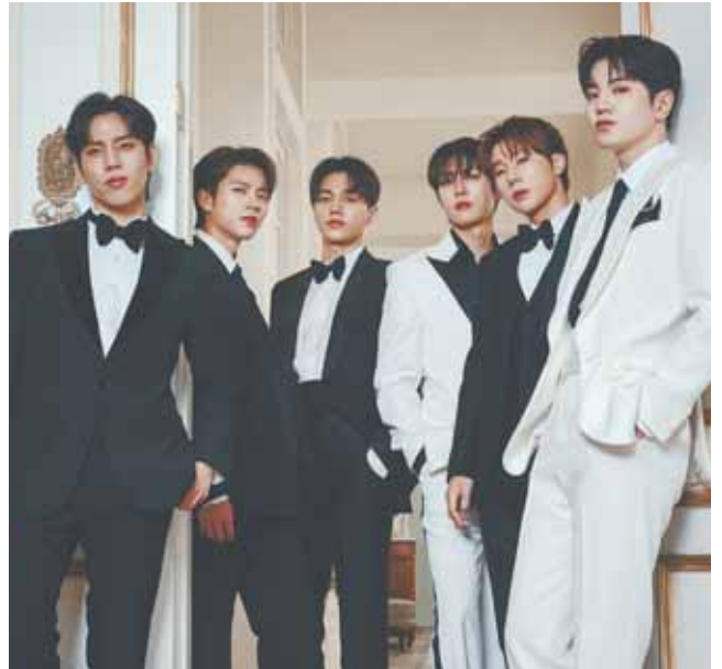
Infinite is a K-pop group that debuted in 2010.

Organised by AllStar Sports and managed by Star Planet, tickets are on sale now.