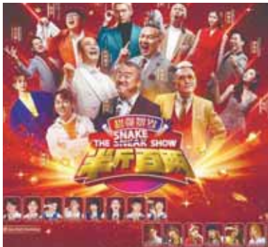
The Snake Show will treat audiences with an immersive experience of the world of Money Games.