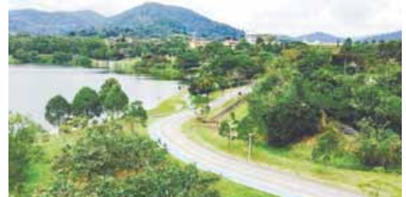
Kepong Metropolitan Park is a large, well-loved urban park in bustling Kepong.

while advanced runners can extend their workout with multiple laps. On weekends, the park comes alive with