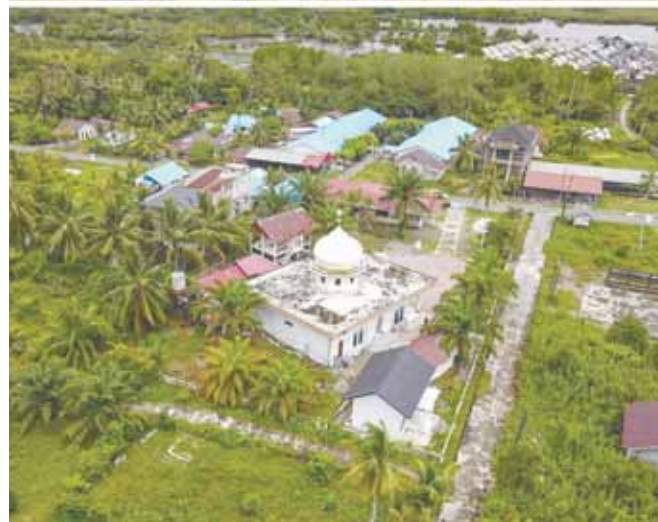
THEN AND NOW ... Photos showing an aerial view of a mosque affected by the 2004 tsunami in Kuala Bujur, Aceh province and the same structure on Nov 17 this year. On Dec 26, 2004, a magnitude 9.1 earthquake struck off the coast of Sumatra and triggered a huge tsunami across the Indian Ocean that killed more than 220,000 people in a dozen countries.