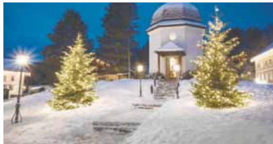
The Silent Night Chapel in Oberndorf.