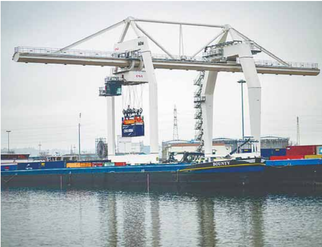
Containers being loaded onto barges on the Rhone at the Edouard Herriot Port in Lyon, eastern France.