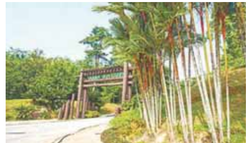
Putrajaya Wetland Park offers tranquil route surrounded by wetlands and wildlife.