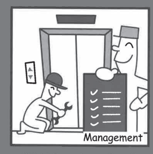
Maintaining and upgrading of Common Property