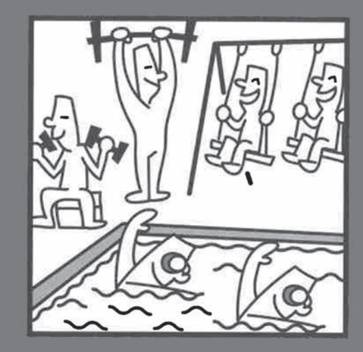
Sharing of Common Property