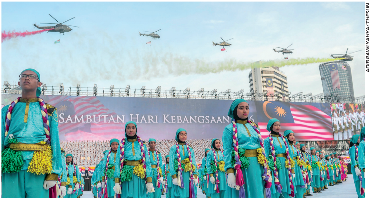
READY TO PERFORM ... Helicopters flying over the Dataran as performers get ready for their event.