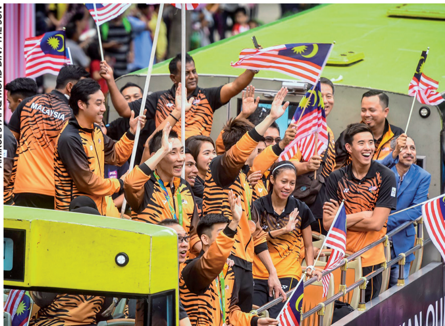
SPORTS THAT BIND ... Malaysia's Rio Olympics participants led by badminton silver medallist Datuk Lee Chong Wei wave to the crowd.