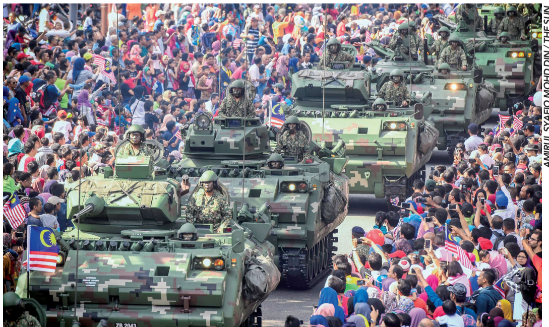
POWER SHOW ... The tanks come a-marching in.