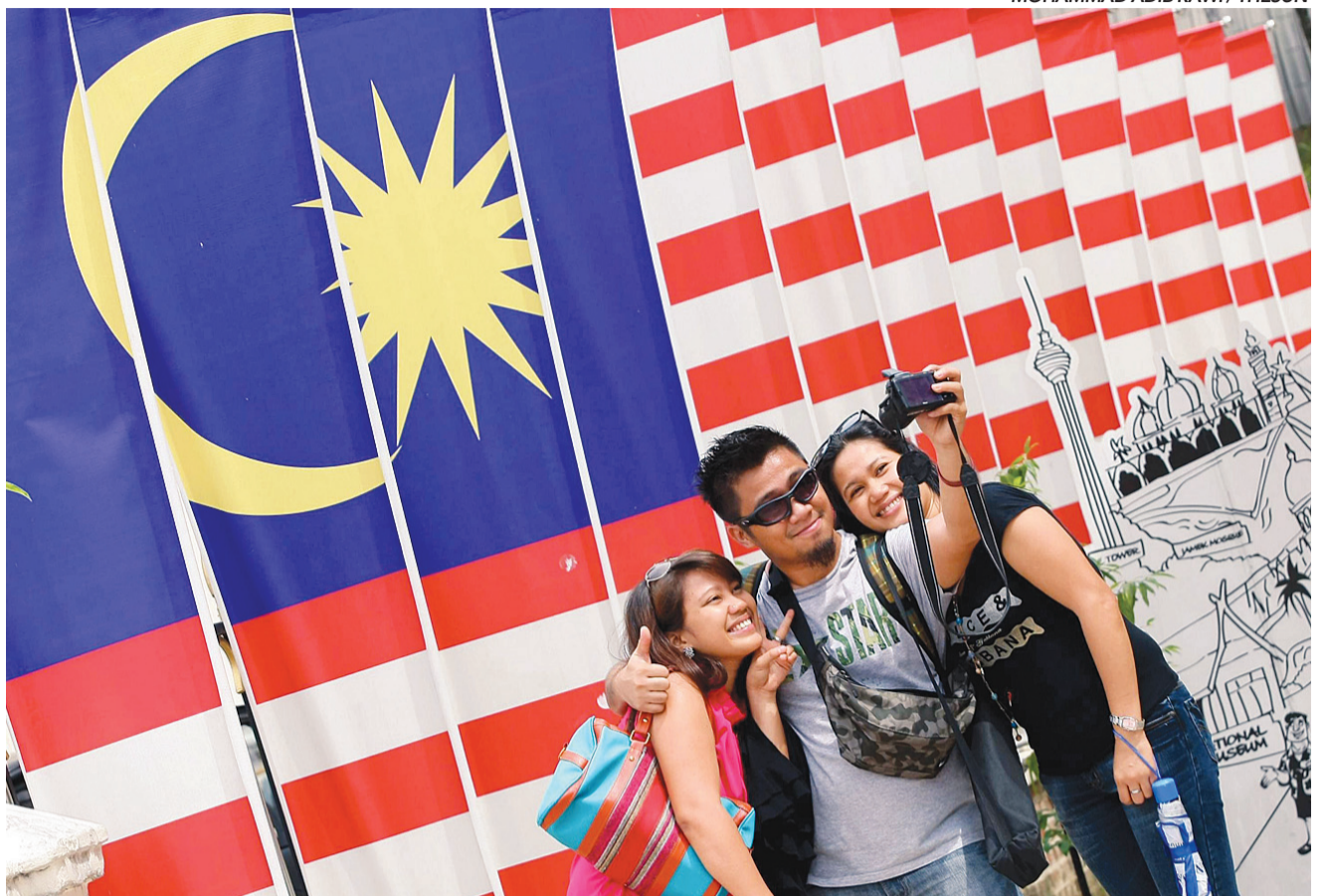
COLOURS OF MERDEKA ... Three tourists visiting the Merdeka Square in Kuala Lumpur yesterday posing in front of a giant Malaysian flag formed by banners erected for the Independence Day celebrations.

He advised the public, including village chiefs and chairmen of village development and security committees, to alert the operations room immediately of suspicious immigrants in their villages. - Bernama